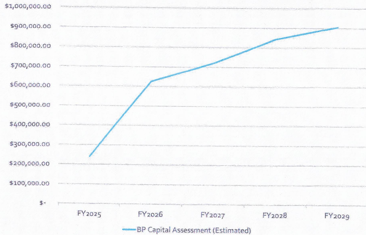
BP Capital Assessment (Estimated)