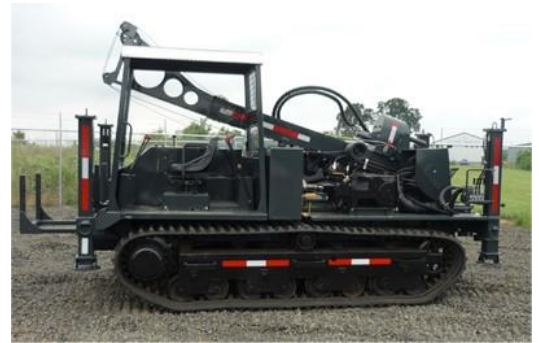
Soil Boring Machine