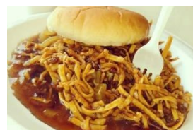
Chow Mein Sandwich