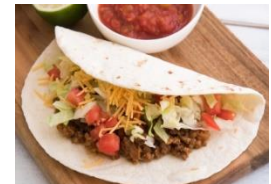
Soft Shell Taco