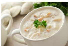
Chowder & Quahogs