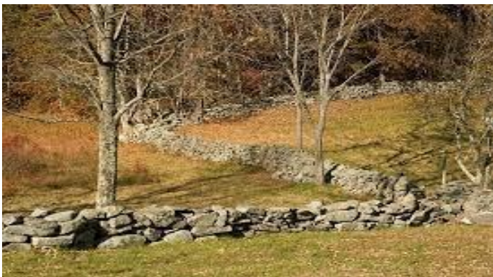
NEW ENGLAND STONE WALL